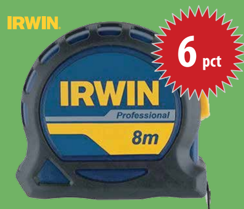
10507792 Ruleta profesionala cu cap magnetic 8 m