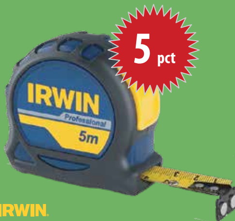
10507791 Ruleta profesionala cu cap magnetic 5 m