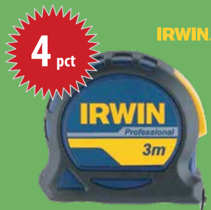
10507790 Ruleta profesionala cu cap magnetic 3 m